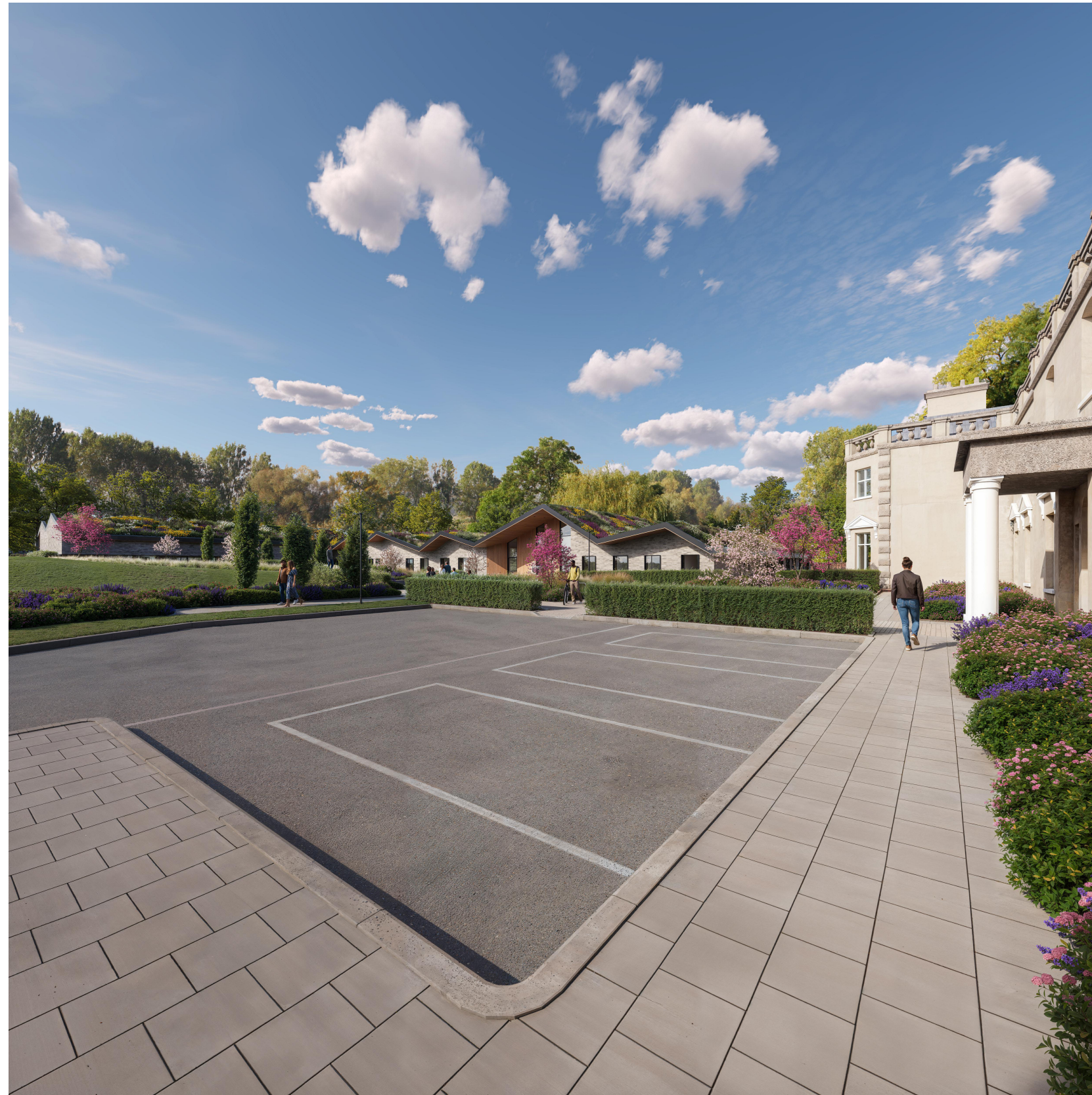
14-Bed Adolescent In-Patient Unit

COPYRIGHT: The design and details shown on this drawing are applicable to The Named Project only and may not be; reproduced, modified or relayed in whole or part or be used for any other project or purpose without the prior written permission of TOT Architects with whom copyright resides. DO NOT SCALE this drawing. Use figured dimensions only. The Contractor is responsible for checking all levels and dimensions on site prior to commencement of works. Any discrepancies are to be referred to the ARCHITECT. Drawings to be read in conjunction with all other Consultants Drawings & Specifications were relevant. Proprietary items shall be fixed in strict accordance with the Manufacturer's Instructions. Sizes of proprietary items shall be checked with Manufacturer.